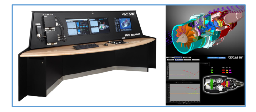
Figure 4: Virtual engine test bench

In 2015, the college procured a virtual engine bench by Price Induction (Figure 4). The test bench offers a unique pedagogical and multi-disciplinary tool for illustrating the behavior and performance of a turbofan engine and providing a platform for practical laboratory coursework and instruction. The virtual test bench replicates the DGEN-380 turbofan engine, a turbofan optimized for general aviation and operation below 25,000 feet. The bench uses an electronic block to simulate engine operation, consisting of the virtual engine, a full authority digital engine control (FADEC) microcontroller, and debug interface. This engine serves as the powerplant for the design. The bench also provides information to estimate aircraft performance parameters. This technology becomes very useful for sizing the aircraft and estimating its performance.