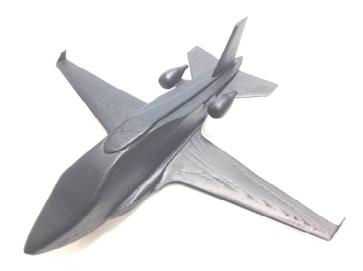
Figure 3: Example aircraft design prototype

presentation using 3D printing or other means. It is further expected that the students will eventually use these prototypes to evaluate preliminary aircraft characteristics by experimental means (i.e., aerodynamic characterization through wind tunnel experimentation). An example prototype is depicted in Figure 4. Again, using emerging prototyping tools is an opportunity relevant to both ETE disciplines.